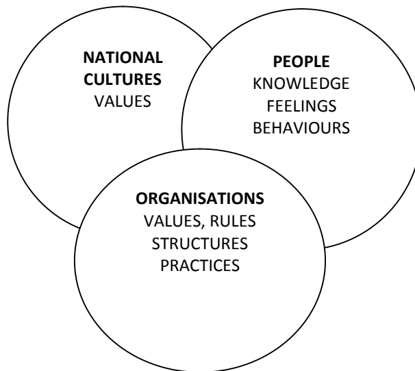
Fig. no. 1. Components defining the intercultural situation