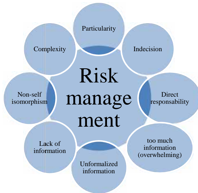
Figure 1. Factors that influence the risk management